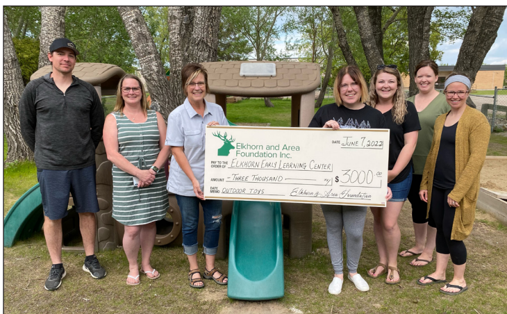
Elkhorn Early Learning Centre