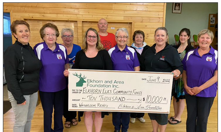
Elkhorn Elks Community Fund

Don't forget our annual grant deadline is March 31st. Applications can be found on our website elkhornandareafoundation.ca , or at the Village of Elkhorn office or by contacting any board member.