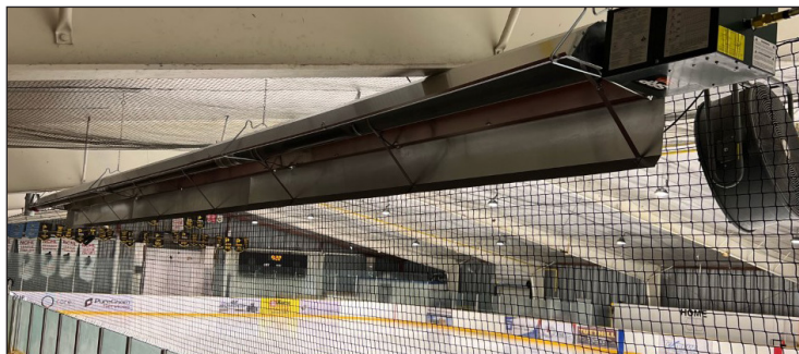
New heaters in Elkhorn District Community Center