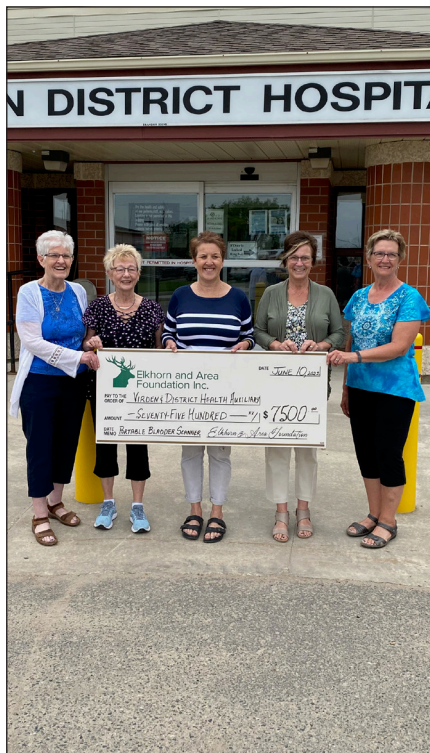
Virден Health Center