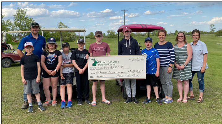
Elkhorn Golf Course