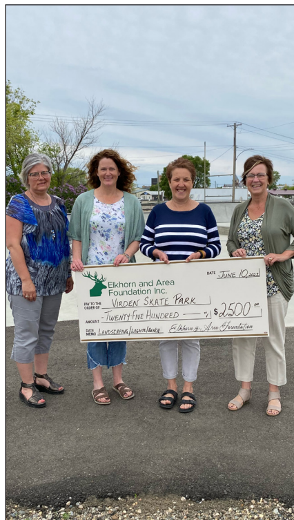
Virден Skate Park