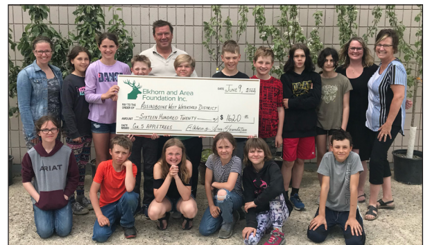
Grade 5 students with their apple trees