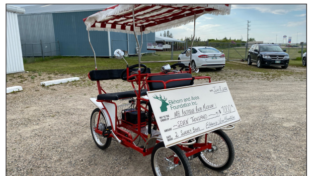
Manitoba Anitque Auto Museum

If have any questions regarding grants or donations or any comments or suggestions, please don't hesitate to contact any of our board members or email info@elkhornandareafoundation.ca